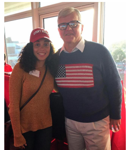
Assemblywoman and SBU alumna Latoya Joyner and Assemblyman Fred Thiele at Homecoming.

Nearly 1,400 students, faculty, staff, alumni, fans, friends and family members got together before the big 2016 Seawolves Homecoming game for good food and fun activities at Wolfstock.